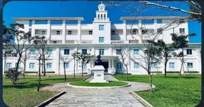
Phan Châu Trinh University