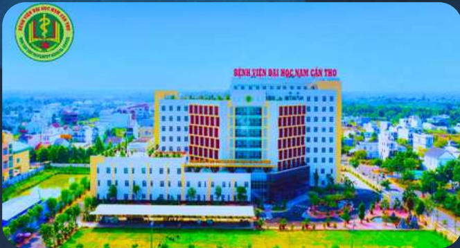
Nam Can Tho University