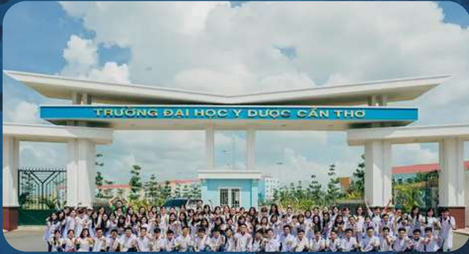
Can Tho University