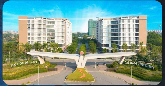
Dai Nam University